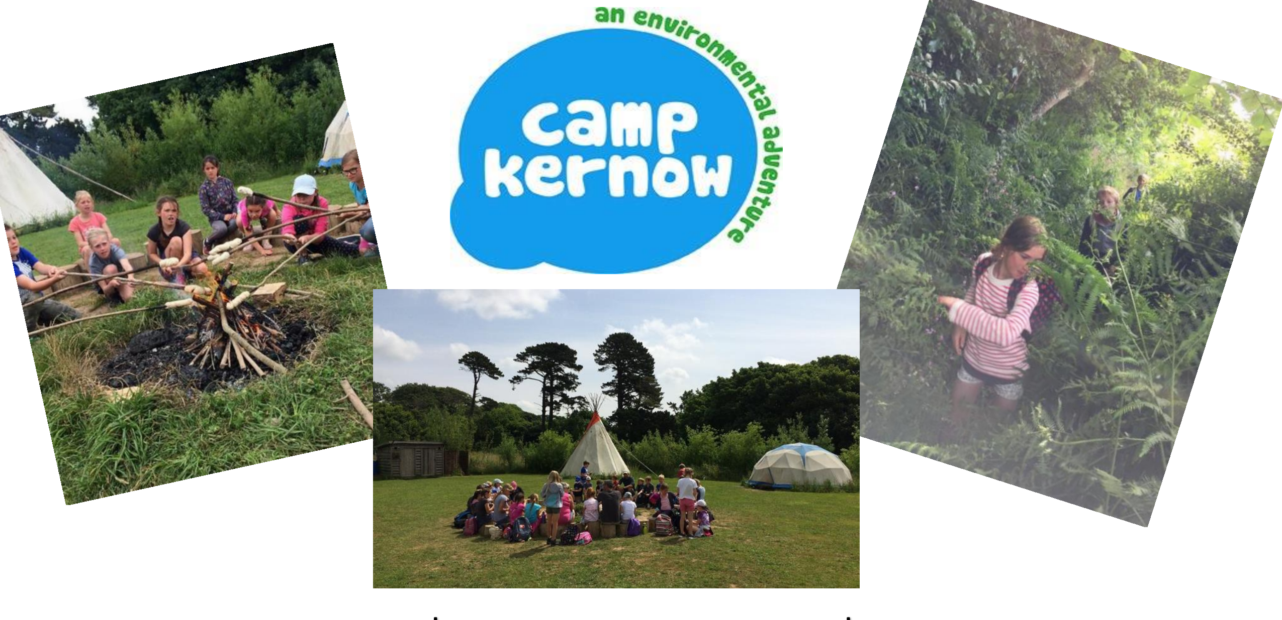
Wednesday 8<sup>th</sup> July – Friday 10<sup>th</sup> July 2020